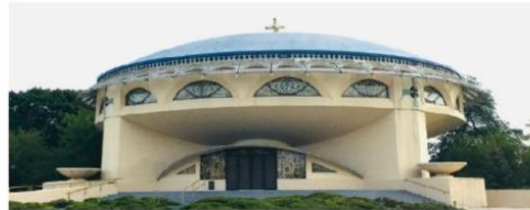
Annunciation Greek Orthodox Church 9400 W Congress St, Wauwatosa, WI

Gathering our Orthodox faithful & friends from all sister Orthodox Parishes for outdoor fun & fellowship for all ages.